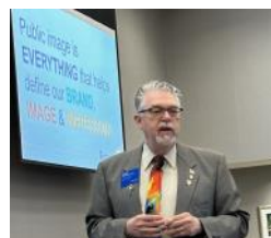
Public Image Scott McLaughlin