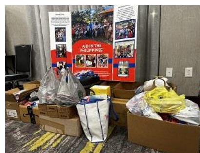
Thousands of toothbrushes, tooth- paste and floss headed for the Philippines. Thanks, everyone!