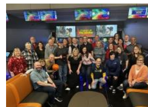
Bowling was a Blast!